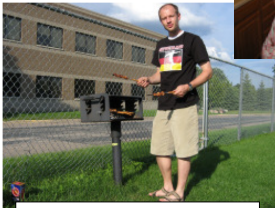
Our 3rd anniversary – the best Barbecue ever.