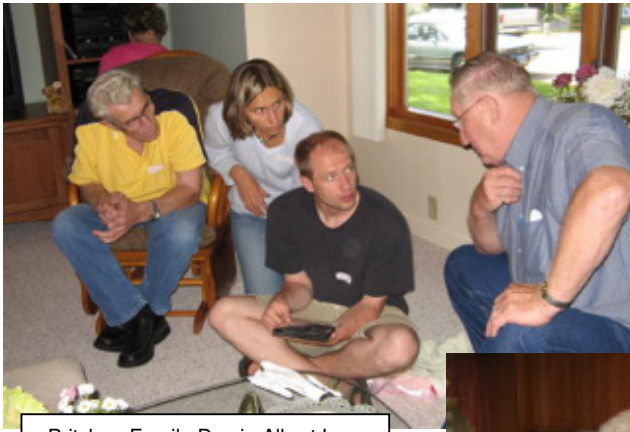
Pritzkau-Familv-Dav in Albert Lea.