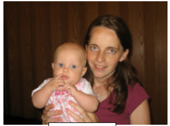
Mommy turned 30!