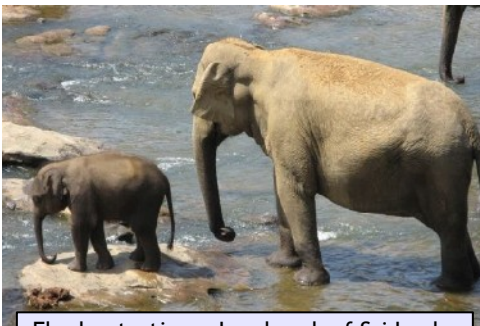
Elephantastic ... Landmark of Sri Lanka