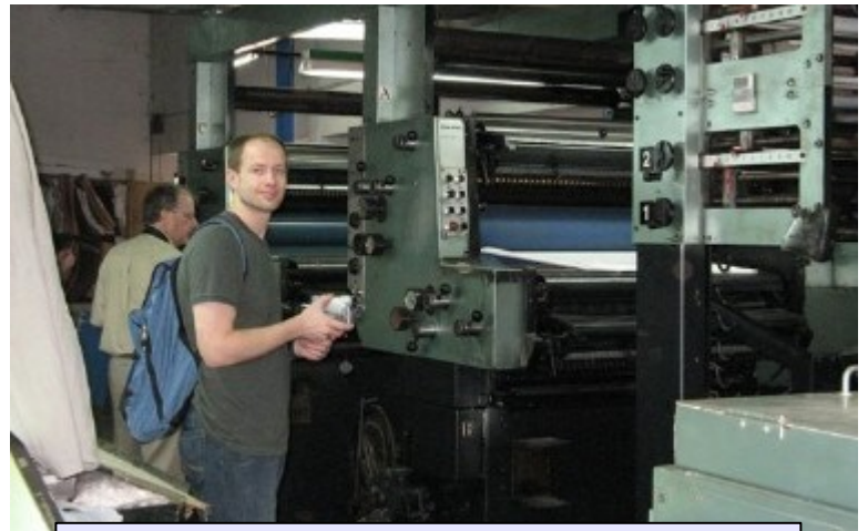
A tour at the printshop NLL