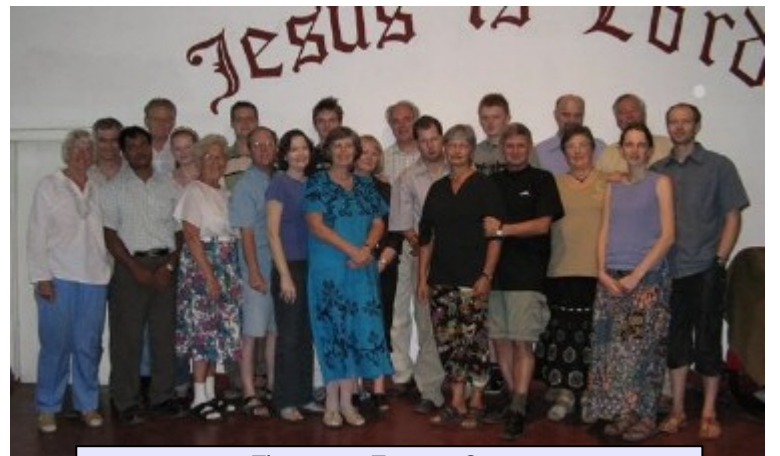
The entire Touring-Group