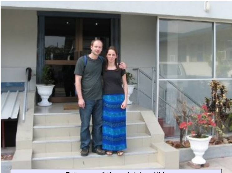
Entrance of the printshop NLL