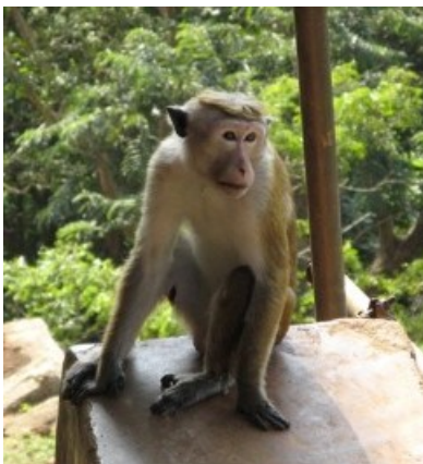
Lots of monkeys in the countryside