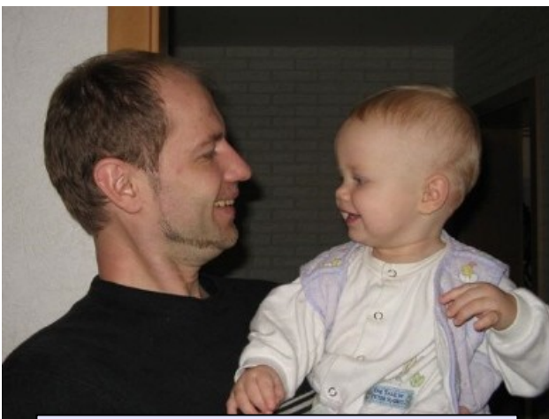
First meeting after the 10-day-trip