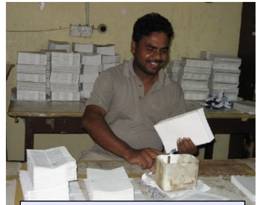
Worker at NLL